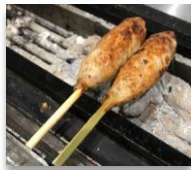
Tsukune Ground Chicken Stick