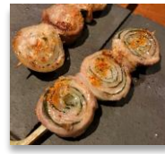
Pork Belly Roll Shiso