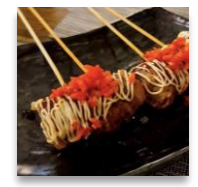
Pork Belly Roll Yakisoba