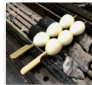
Uzura Tamago Quail Eggs